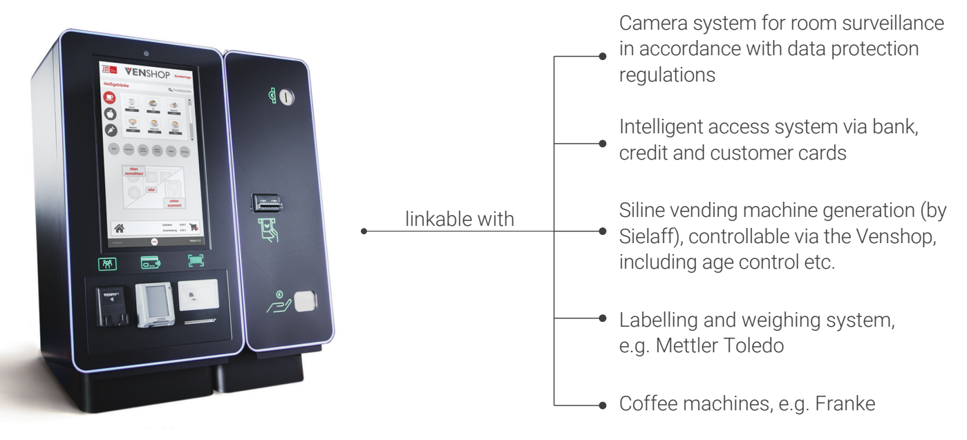
Cashless-Modul + Add-on module (cash)

As the central payment system for the entire shop, including all vending machines, it enables cashless payments of all kinds as well as cash payments on request.